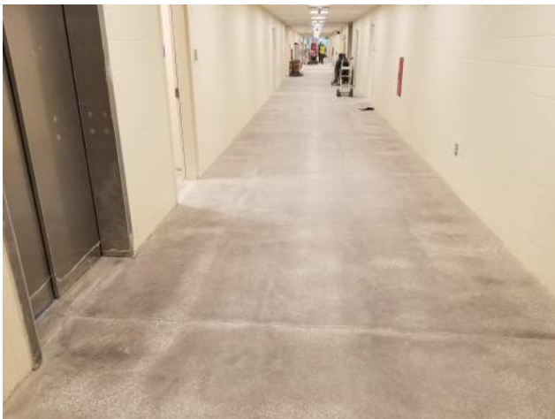
Prepping Cedar Level North Corridor for Carpet Tile