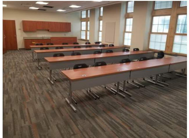
Installation of Furniture in Area A Cedar Level