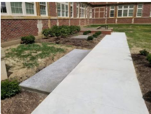
Installation of Memorial Items in Progress