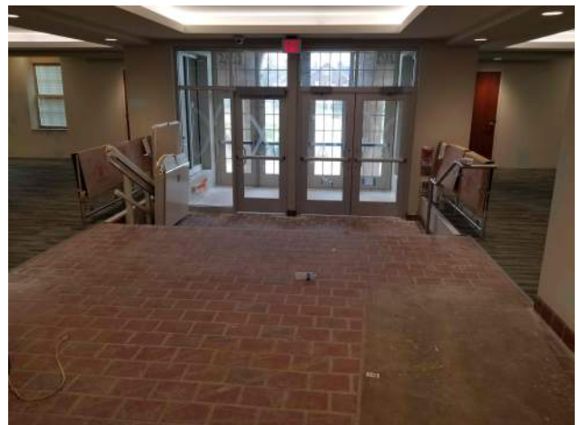
Finishes at Area G Cedar Level Entrance