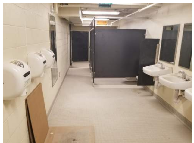
Toilet Accessories at Home Locker Room