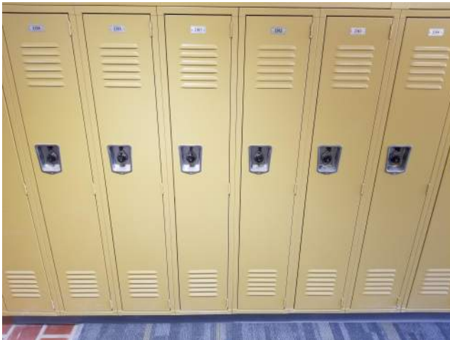
Numbering and Installation of Locks on Lockers